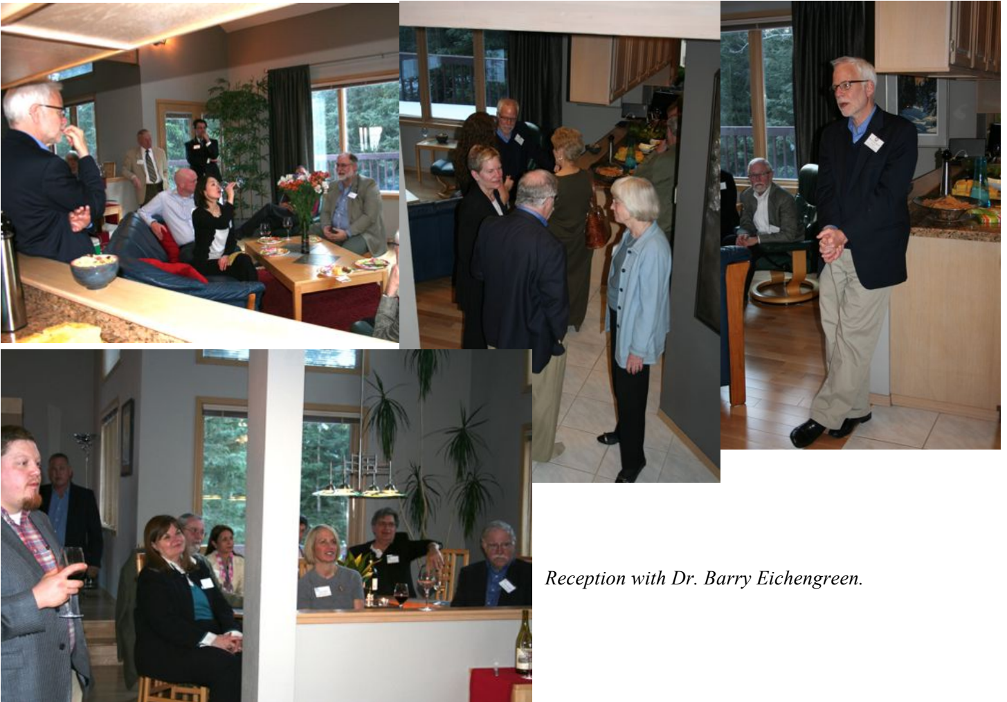
Reception with Dr. Barry Eichengreen.