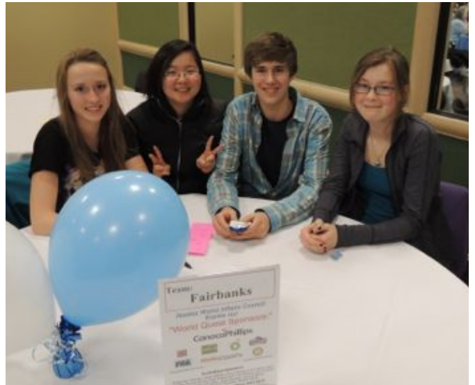
Student team from Fairbanks is all smiles.