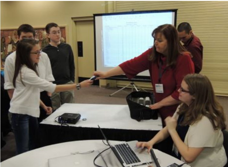
The new clicker system and electronic scoreboard.