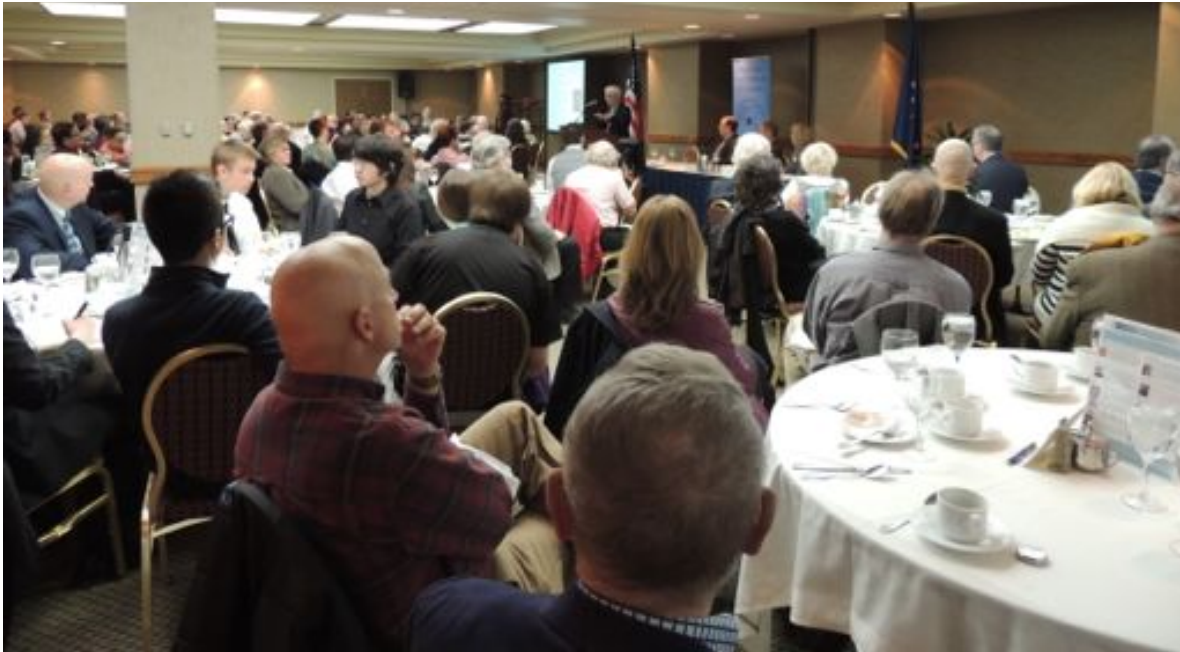
Global Business Series Speaker, Barry Eichengreen speaks to our largest audience of 2012/2013 with 183 people!

Attendance for the year decreased 20% with an average of 107 people per event compared with 129 people per event last year. Total membership increased from 349 members last year to 401 members this year, however, individual memberships decreased 7% from 227 members last year to 212 this year.