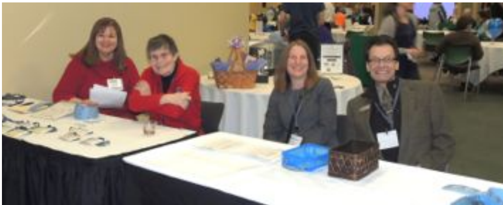
AKWorld Board Members volunteering at the WorldQuest check-in table