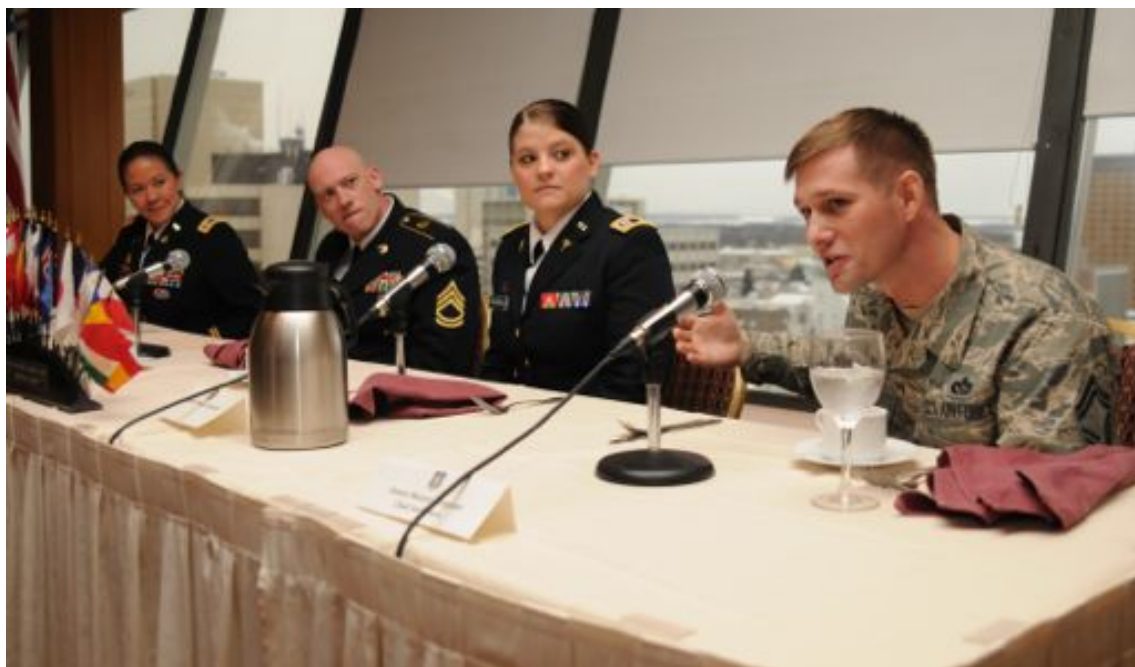
The Alaska Service Personnel panel captivated their audience with their experiences in Afghanistan

This year was the second year of a sponsorship by UAA allowing for all UAA faculty and staff to attend AKWorld programs at no cost. Over 70 UAA faculty and staff attended programs through this sponsorship. We are currently looking for a sponsor to help military personnel and families allowing them to come to AKWorld Programs without a cost barrier.