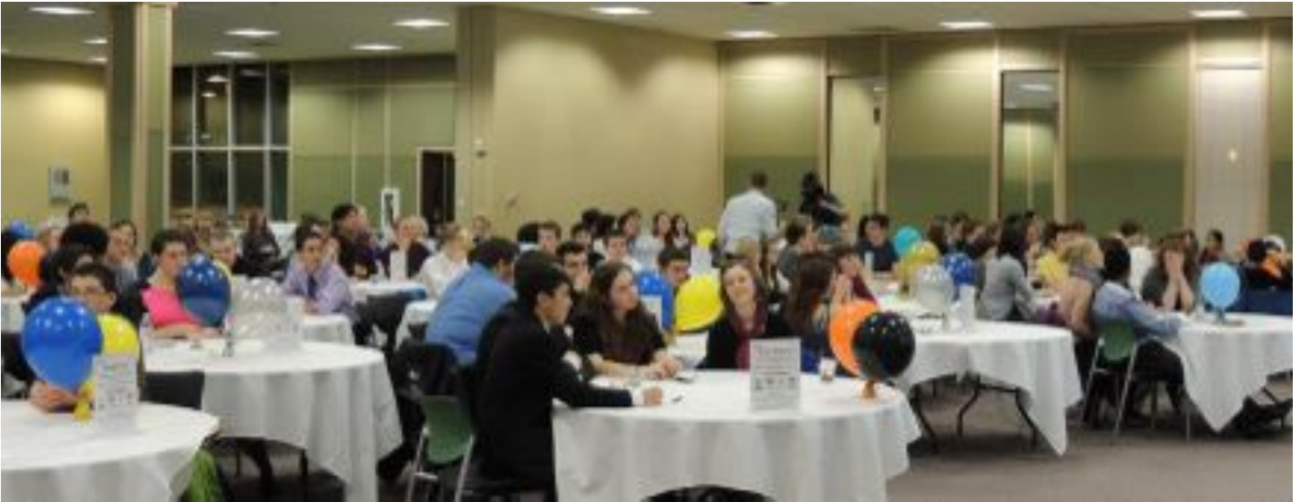
A full house at the UAA Lucy Cuddy for the 2013 Academic WorldQuest Competition